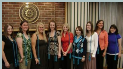
Siena College Initiates