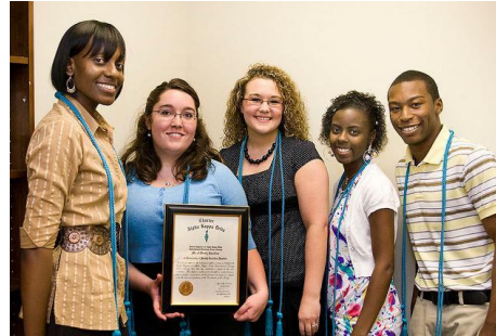
University of South Carolina Upstate Initiates

Alpha Kappa Delta Le Moyne College 1419 Salt Springs Road Syracuse, NY 13214